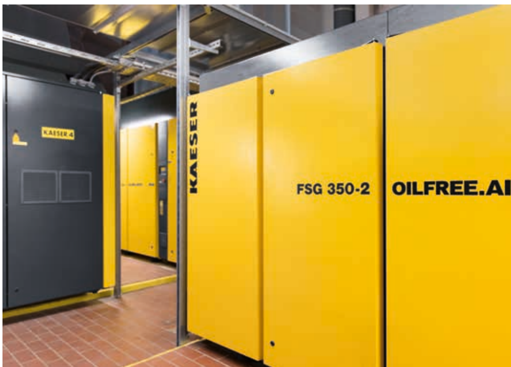
Compressed air fulfils a number of important functions at the Hanover facility, including transportation of the lead oxide.

cover, even in the event of maintenance or repairs. Calculations showed that the most cost-effective and dependable solution was to distribute the required capacity, which was previously provided by two large-sized dryers, amongst a total of six smaller, energy-saving SECOTEC TF 340 refrigeration dryers. These models im-