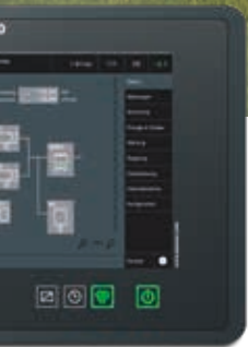
Image left: The SIGMA AIR MANAGER 4.0 ensures maximum energy efficiency for the whole compressed air system.

hydropower has been in operation at both of the company's facilities. Photovoltaic systems are installed on the roof of the production building, which since last year have been used to power both production processes and electric vehicles. The business has targeted achieving CO 2 -neutrality by 2030. The themes of sustainability, energy efficiency and dependability were also important factors in KAESER's favour when GAPLAST began searching for suitable suppliers for its planned compressed air station at the new building in Peiting. "We had already had a good experience with KAESER at our Altenau facility," remembers Facilities Engineering Manager Stefan Krinner. "The system there is quite old, but after 120,000 operating hours it still runs without any problems. We were also already operating KAESER compressors in Hall 2 and were very satisfied with them." Virtually every production area at the Peiting factory relies on compressed air. The