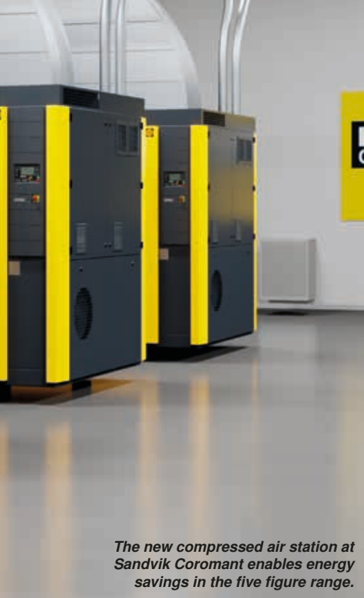
The new compressed air station at Sandvik Coromant enables energy savings in the five figure range.