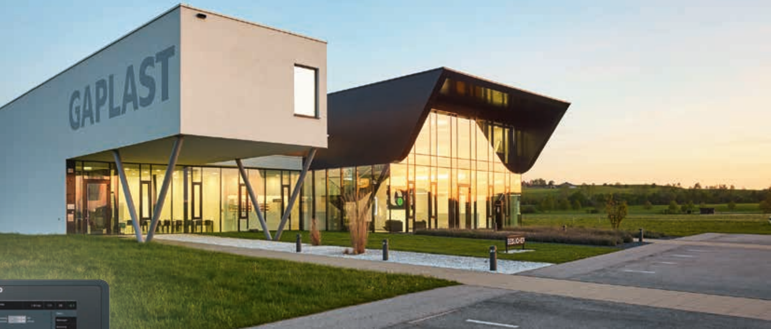
Image above: The entrance to the company's new premises in Peiting.