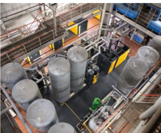
Two different compressed air treatment systems dry the compressed air for the respective requirements.

Environmental protection plays a key role at Enertec Hameln GmbH. Emission limits, in accordance with the 17th Federal Emission Control Ordinance, are not only safely adhered to but are significantly undershot thanks to highly efficient flue gas cleaning, in which compressed air also plays an important part. In the future, an ever-increasing proportion of the company's energy consumption is to be covered by renewable