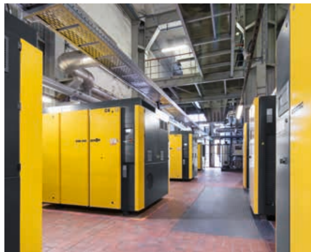
A total of four rotary screw compressors with IE4 drive motors and the energy-saving SIGMA PROFILE operate in the compressed air station.

We not only take investment costs into consideration but also the ongoing operational costs...KAESER was clearly the best choice.