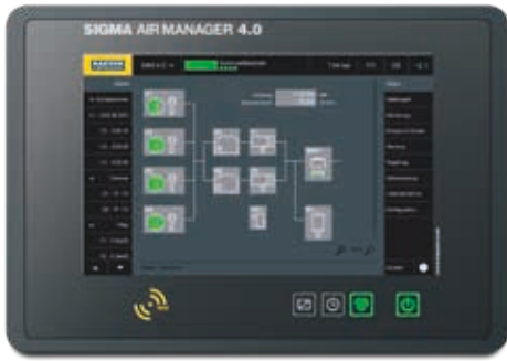
Image, top left: The SIGMA AIR MANAGER 4.0 master controller ensures that the entire compressed air station operates at peak efficiency.