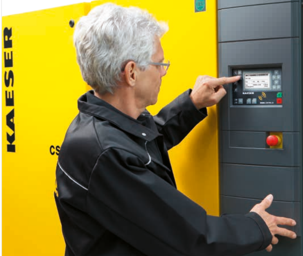
The control unit SIGMA CONTROL 2 is the integrated intelligence.

system including four DSD 175 rotary screw compressors, three TG 980 Secotec dryers, a SIGMA AIR MANAGER (SAM) 4.0, increased storage, and a new SmartPipe distribution system. Plus, Coromant needed a smaller secondary system for extra machining consisting of two SK 20 rotary screw compressors and a SAM.