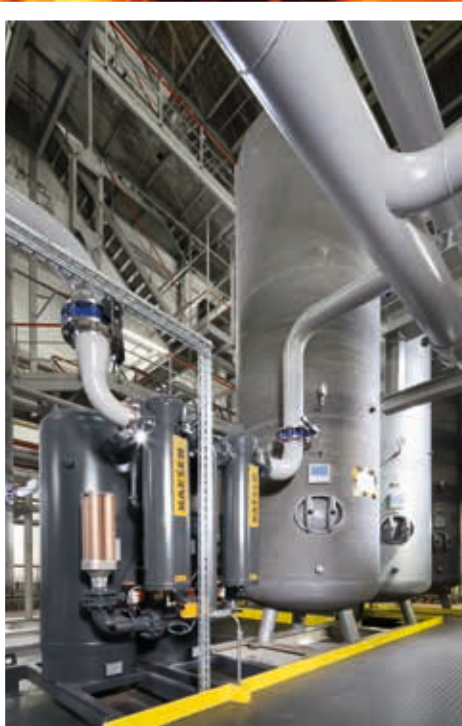
The 70,000-litre storage volume is divided between eight compressed air receivers.

Today, this historic town in Lower Saxony is making headlines for its numerous environmental initiatives. Enertec Hameln GmbH, a subsidiary of Interargem GmbH, has seamlessly integrated its thermal waste treatment plant into the panoramic landscape of this eco-conscious town. The plant not only provides thermal recycling of delivered waste that is no longer materially recoverable, but also harnesses this waste for energy generation. Indeed, the so-called municipal waste is an important source of energy with an average energy content equivalent to that of brown coal. District heating is particularly climate-friendly; it preserves natural resources and provides a high level of supply security. Therefore, utilizing energy from waste also makes a significant contribution to the energy revolution. In thermal waste treatment, one of Enertec's core competencies, the energy released during combustion is harnessed and converted into electricity and district heating through combined heat and power. From the current treatment capacity of 350,000 tonnes of waste per year, 118 MWh of electricity and 213 MWh of district heating are generated. The produced district heating is drawn off as energy for heating purposes or as process steam and is directed to consumers through Enertec's own district