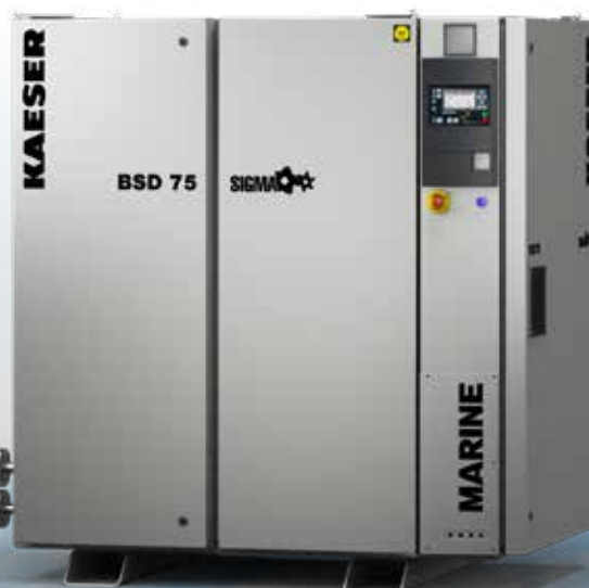
Compressed air on the luxury cruise liner is provided by four identical BSD 75 Marine rotary screw compressors.

compressors ensure the required supply. For dependable compressed air treatment, two SECOTEC TE 102 energy-saving refrigeration dryers and an array of filters are installed. This KAESER solution has succeeded in improving the energy consumption of the compressed air supply by 13% over the original installation. What is more, using Marine compressors from the same series for the entire onboard compressed air requirement provides advantages when it comes to maintenance and servicing. After transferring via the River Ems, the SILVER NOVA is expected to be delivered to the shipping line at Bremerhaven, whence it will commence its maiden voyage to Venice. En route, up to 728 guests will experience the tailored service for which Silversea is renowned, as well as the innovate design, exquisite restaurants and spacious luxury suites attended by a personal butler.